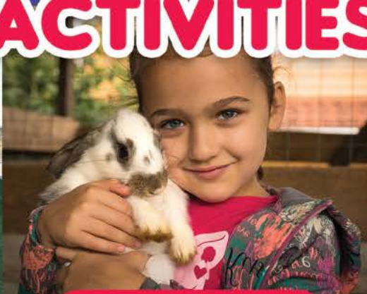
CUDDLY ANIMAL FARM