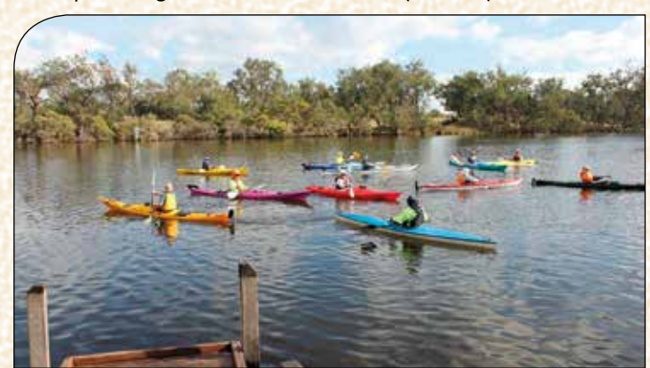
On the water, a flotilla of 'Grey Dolphins' warm up in preparation for their paddle upstream to Dandelup Creek.