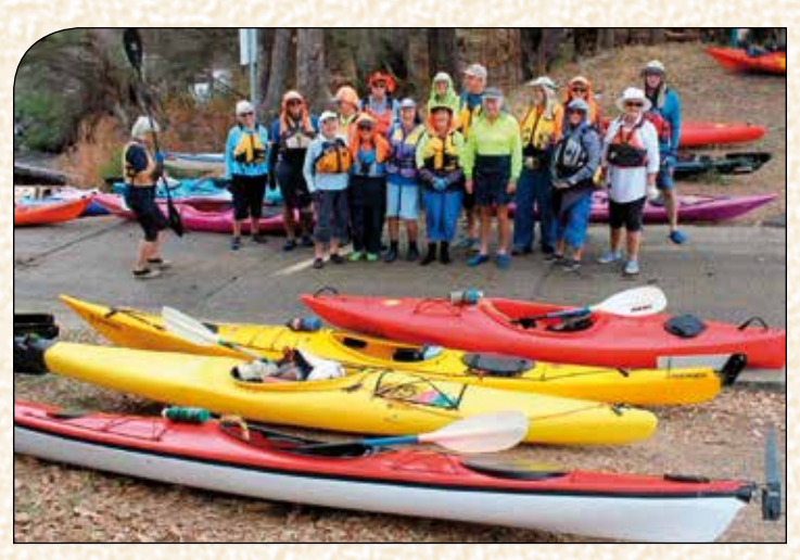
Pre-trip briefing: You lot must all be on your very best behavior!