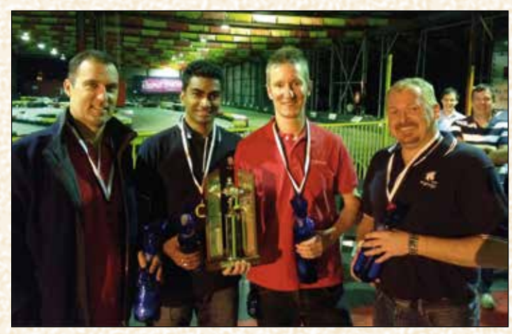
Team Dragon take line honours for 2012

After all the heats were complete it was time for the final.....CBA, St George, Oakvale and ANZ hit the track for the decider.